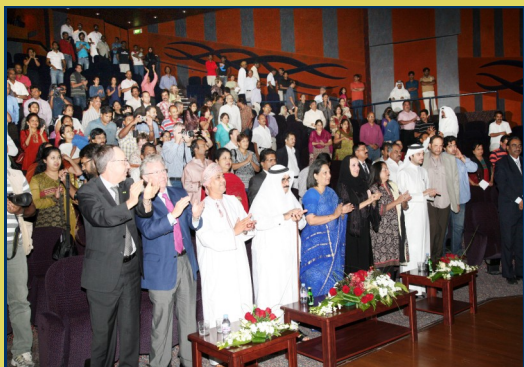
Standing ovation given by Ambassador and audience to the Kathak Dance group