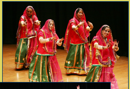
A glimpse of Rajasthani Folk Dance