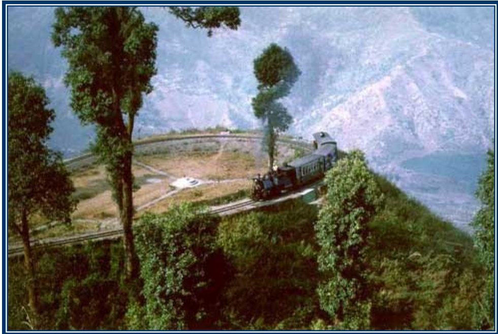
Darjeeling – A popular Hill Station

Darjeeling fondly called "Queen of the Hills" is the dreamland of the East; it has been a popular hill station since the British period. Darjeeling in India owes its grandeur to its natural beauty, its clean fresh mountain air and above all, the smiling resilient people for whom it is a home. Darjeeling is surrounded by lofty mountains. Except for the monsoon months and if weather is clear then the Kanchenjunga peak can be seen. Down below in the valley flow the rivers swollen by rain water or melting snow. Darjeeling is a fascinating place rich in natural beauty and surrounded by the Buddhist monasteries. Its beauty surpasses any other hill station. The toy train coming from Siliguri is something, which is liked by the elders and the children equally. The real fun in coming to Darjeeling is on the toy train. It takes six to seven hours to cover a distance of 82 kms and the slow speed gives you enough time to watch and appreciate the beauty which nature has provided it. This train passes through the Forests, waterfalls, over deep valleys and through the mountains and tunnels.