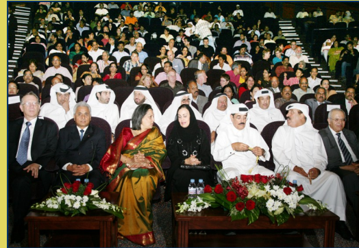
Minister of Culture & his wife watching performance of Rajasthani Folk Dance along with the Ambassador on the opening day